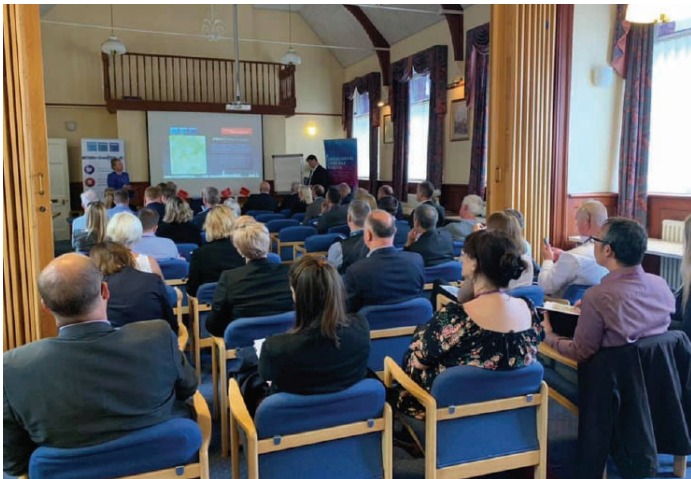
Consultation event with Team Lincolnshire members

The vision for Boston and its Town Investment and projects are the result of extensive consultation and engagement with key cross-sector stakeholders throughout Boston and the region.