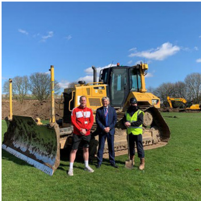
Groundworks commence at Haven High Academy for the 3G pitch

Accelerated funding has enabled Haven High to unlock this much needed facility that will be used not just by the school, but the wider community.