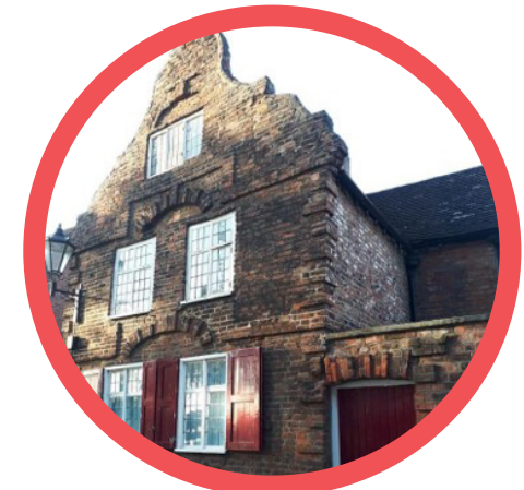
Blenkin Memorial Hall