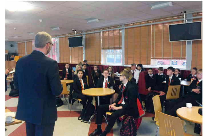
Haven High Academy consultation with pupils