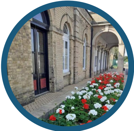
Boston Train Station