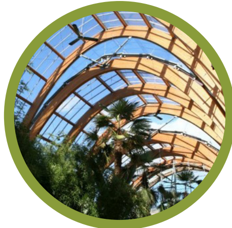
Plans for Mayflower