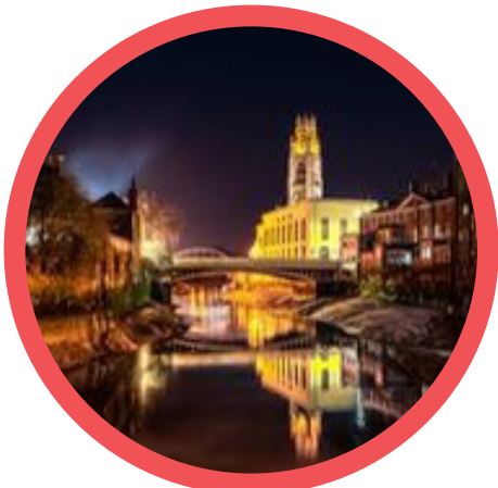
St Botolph's Church