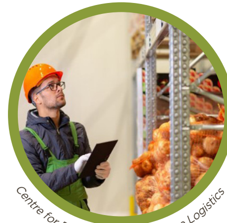
Centre for Food and Fresh Produce Logistics