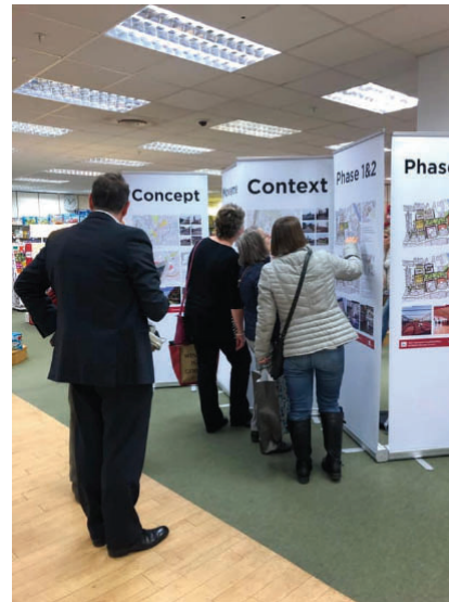
Oldrids department store consultation with members of the public