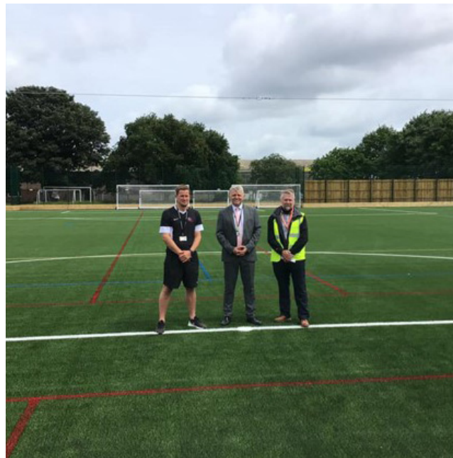
Completion of the 3G pitch

“We are delighted to see our 3G pitch delivered on time and to budget. This is an excellent example of collaboration between Haven High, the Borough Council, Boston Town Deal Board and the Football Federation. We cannot wait for members of the academy and the local community to benefit from this investment.”